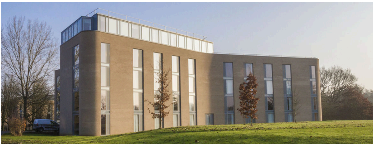
Picture: Bluebell student accommodation on campus

Your flatmates are where you begin with. Start making friends!