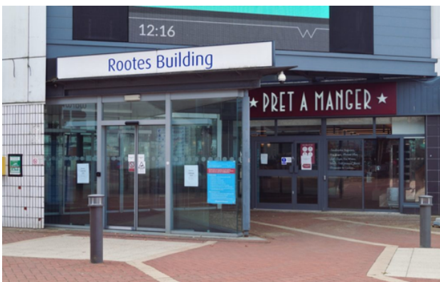
Picture 2: Entry for student study grid and coffee shop. Upstairs there is Fusion Bar.